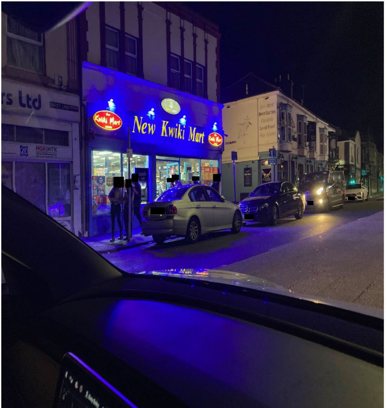
Ross Lee 16 October 2021